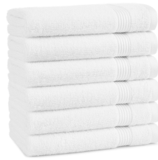
16" x 28" 3.5lb Hand Towel 6-Pack