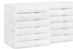
13" x 13" 3.5lb Washcloth 12-Pack