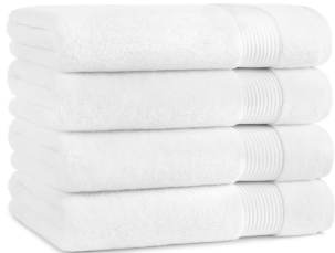
27" x 54" 15lb Bath Towel 4-Pack