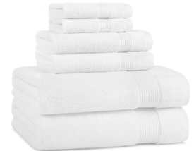
Bath Collection Set 2-Bath, 2-Hand, 2-Wash